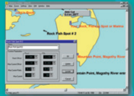
Set local knowledge measurements for your dock, marina, fishing spot, or any port of call