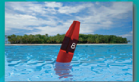
Real-time, real-place tide and current animations