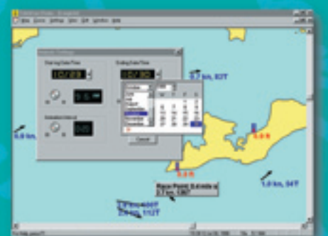
Current diagrams feature stop action and sequential views of tides and currents for any time or date